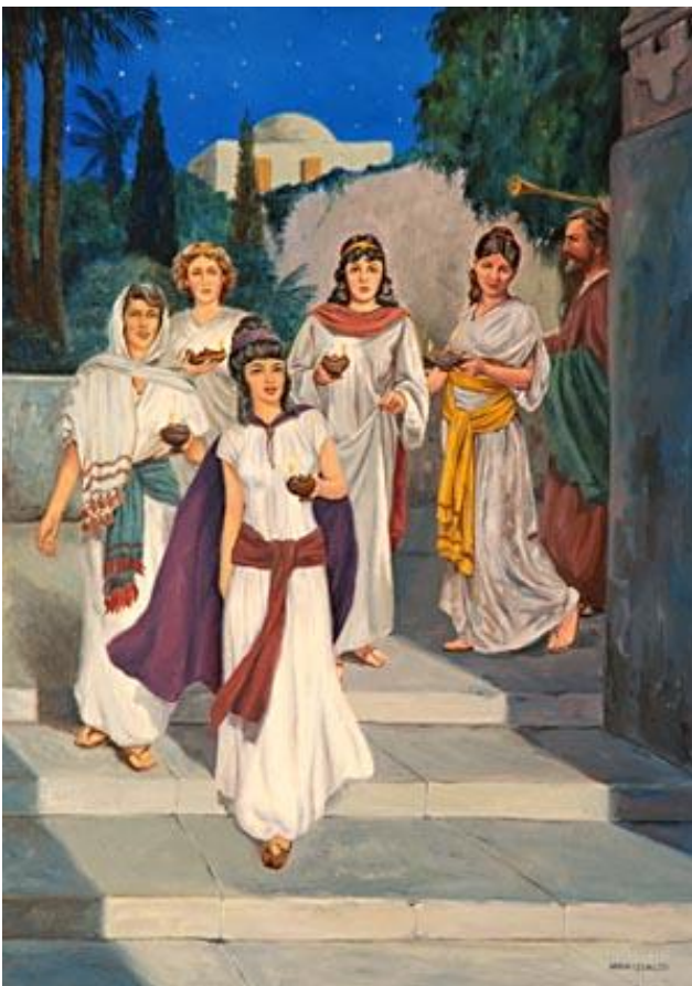
Based on Matt. 25:1-13

Ellen G. White, Christ Object Lessons , Chap. 29: "To Meet the Bridegroom"